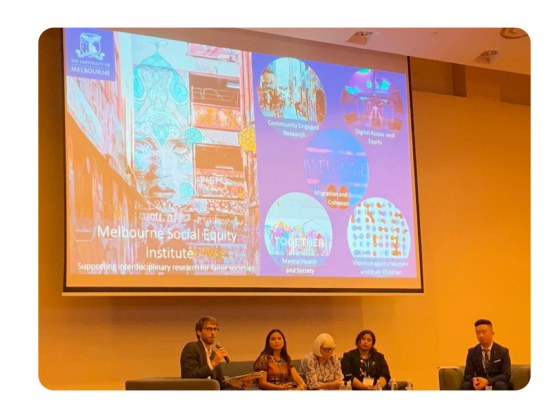
5:05 pm · 7/11/19 · Twitter for iPhone